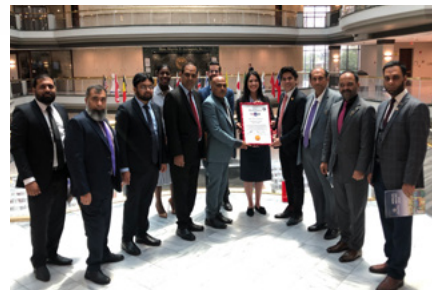
MOIIA, Invest Atlanta & Atlanta City Council members hosted business representatives from Pakistan