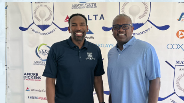
Governor Albert Bryan Jr of the U.S. Virgin Islands