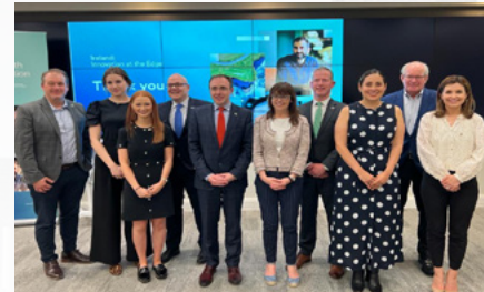
Irish Minister for Trade Promotion, Robert Troy, & 26 Irish companies